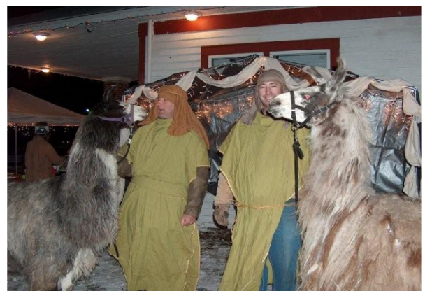
The live manger scene was a blessing!