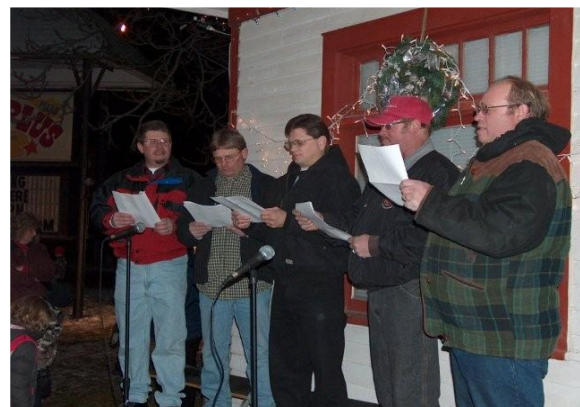
The Rawson Brothers sang like angels!