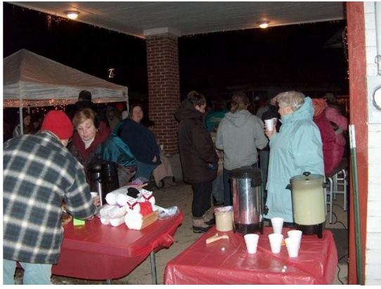
Hot chocolate, cider and homemade snacks kept all warm and happy!