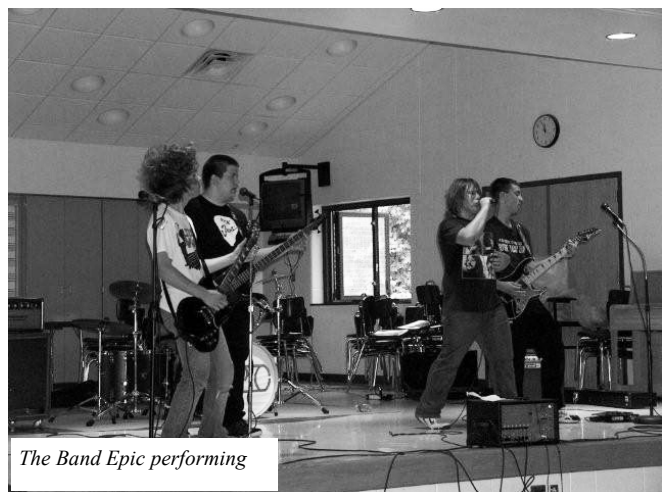
The Band Epic performing