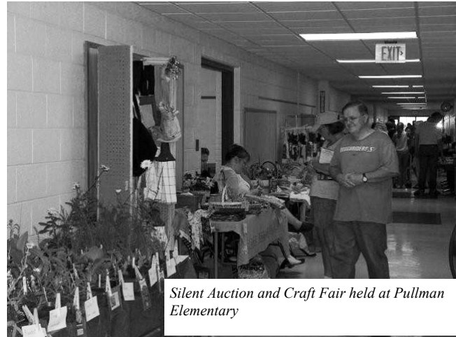
Silent Auction and Craft Fair held at Pullman Elementary

We look forward to seeing everyone out there next year Saturday July 18 th RAIN OR SHINE!